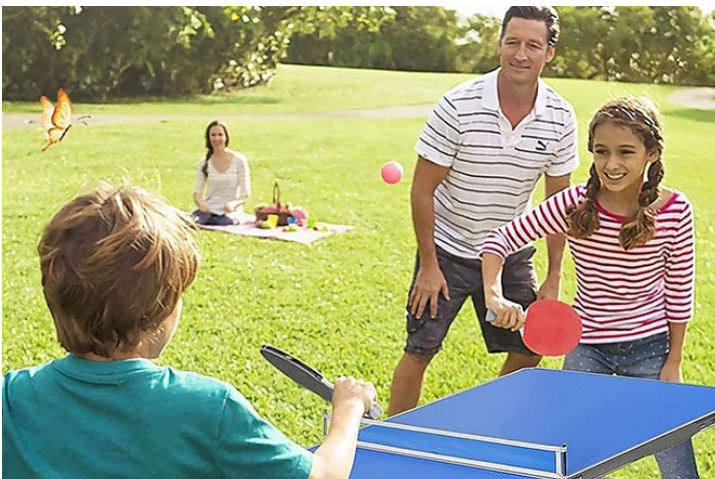
Table Tennis Day

Messy play is the ultimate way for a child to meet their sensory needs; whether its digging their hands into some coloured spaghetti or having a mock snowball fight with shaving cream.